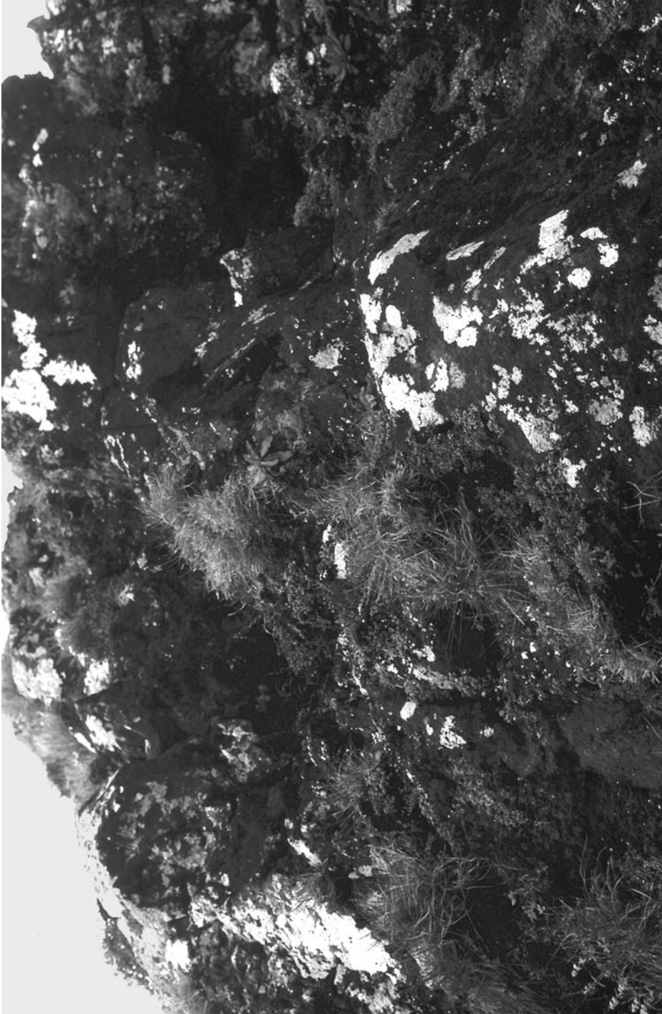
Fig. 2. Lolium saxatile in its habitat on Fuerteventura in the northern escarpment of Pico de la Zarza, c. 800 m.