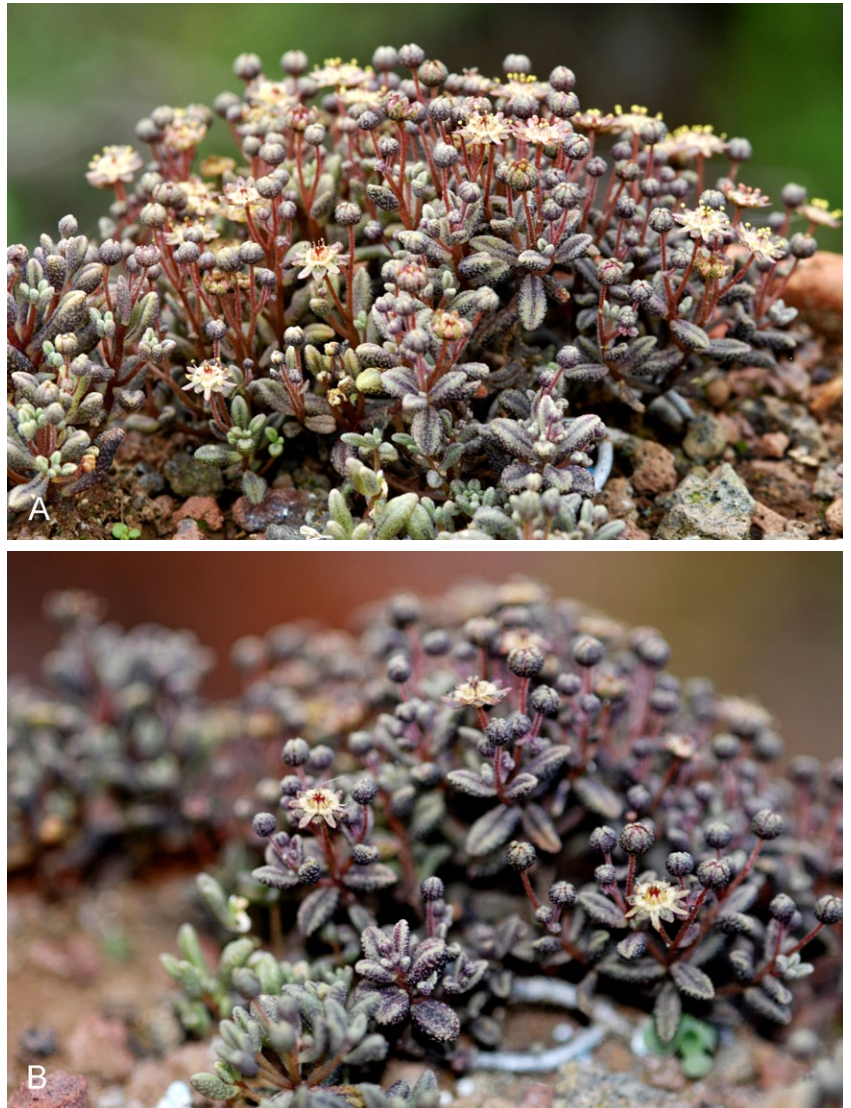
Fig. 3. A–B: an individual of Monanthes subrosulata at the type locality (Spain, La Palma, “Canal de Tegalate”, 425 m) on 1 Apr 2006. – Photos by A. Bañares Baudet.

References on the chorology of the species of Monanthes in La Palma (Santos 1983; Nyffeler 1992; Bañares 2008) and a recent survey in the field revealed two sites with co-occurring taxa (showing a close connection among individuals): (1) M. laxiflora – M. polyphylla subsp. amydros in the central part of La Palma at La Es-