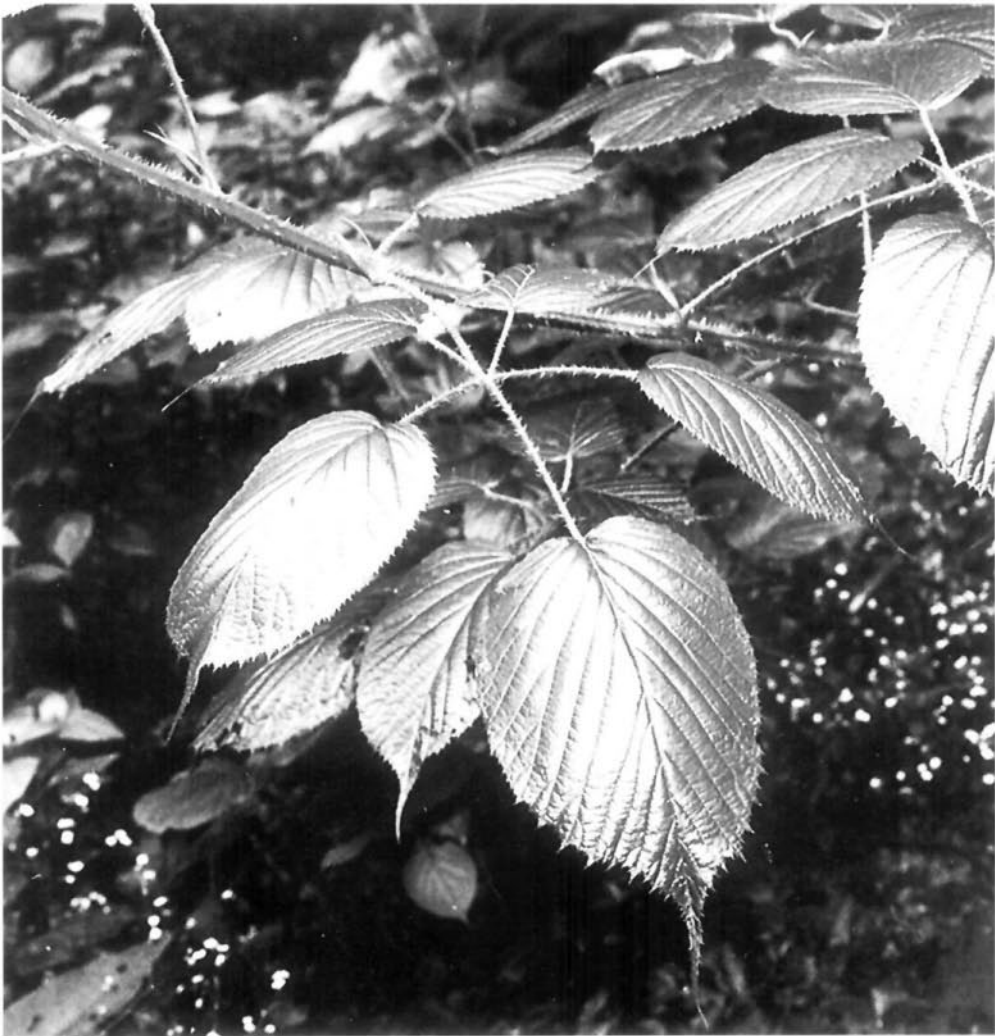
Fig. 3.— Rubus palmensis : Bco. de la Galga, La Palma, 1998, G. Matzke-Hajek.

The "La-Palma-Blackberry" belongs to the series Grandifolii Focke, a group represented