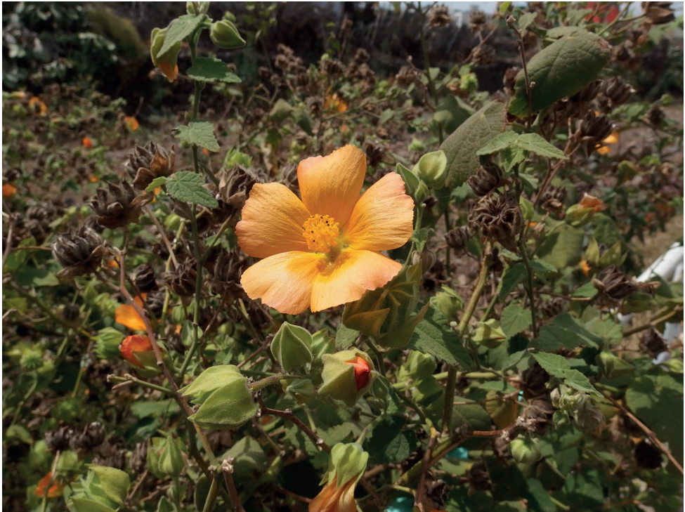
Figure 5. Abutilon grandifolium in Telde, Gran Canaria. April 2017, F. Verloove. For many decades, A. albidum was erroneously considered to be a synonym of this invasive species from South America. Abutilon grandifolium has much larger, more orange-yellow corollas and sepals forming longitudinal keels in bud and saccate at base.

SW. Pitard and Proust (1908) also mentioned it from another ravine in Santa Cruz, the Barranco del Bufadero. The species was said to be very rare in Tenerife. Burchard (1929) probably presented the most extensive (and most recent) update of its occurrence on the Island. It was mostly seen between San Andrés and Igueste [F.V.: i.e. Igueste de San Andrés], including below the Los Órganos cliffs [F.V.: i.e. north of the Las Teresitas Beach]. It was also said to have isolated occurrences in Santa Cruz, where it had probably become extinct. All documented occurrences, except for a single record from La Orotava, were from the extreme south-eastern part of the Island where it occupied an area of hardly more than 12 km 2 . In Tenerife, it was probably last collected in 1945 by E.R. Sventenius. According to some sources, it was formerly also collected in Gran Canaria (Barranco de la Angostura) (Pitard and Proust 1908); unfortunately, no specimens are present in the LPA herbarium.