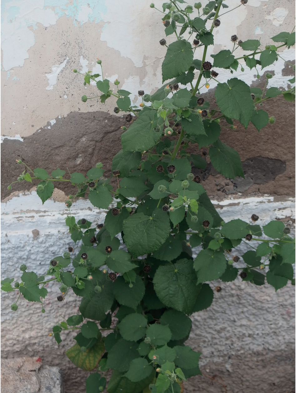
Figure 3. Abutilon albidum in Igueste de San Andrés, Tenerife. Flowering and fruiting individual. December 2019, F. Verloove. In Tenerife, this species is now mostly found in anthropogenic habitats.

Webb and Berthelot (1836) reported Abutilon albidum from ‘Barranco Santo’, near the Zurita Bridge, in Santa Cruz de Tenerife, in the south-eastern part of the Island. It had previously been collected from Tenerife in 1796 by A. de Jussieu (P!; see specimens examined). It was considered a Canarian endemic (Masferrer y Arquimbau 1880). Nearly