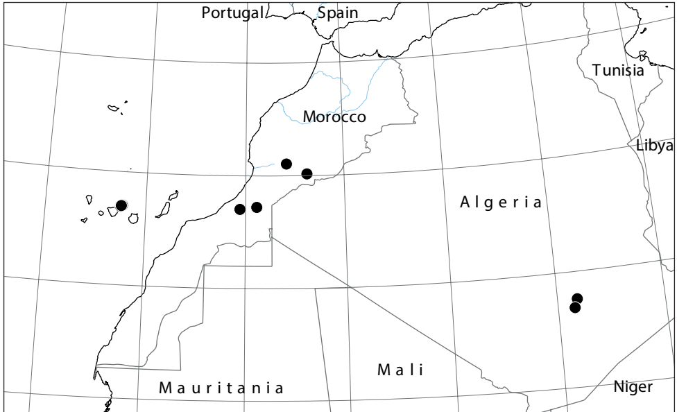
Figure 6. Worldwide distribution of Abutilon albidum (historical and current records).