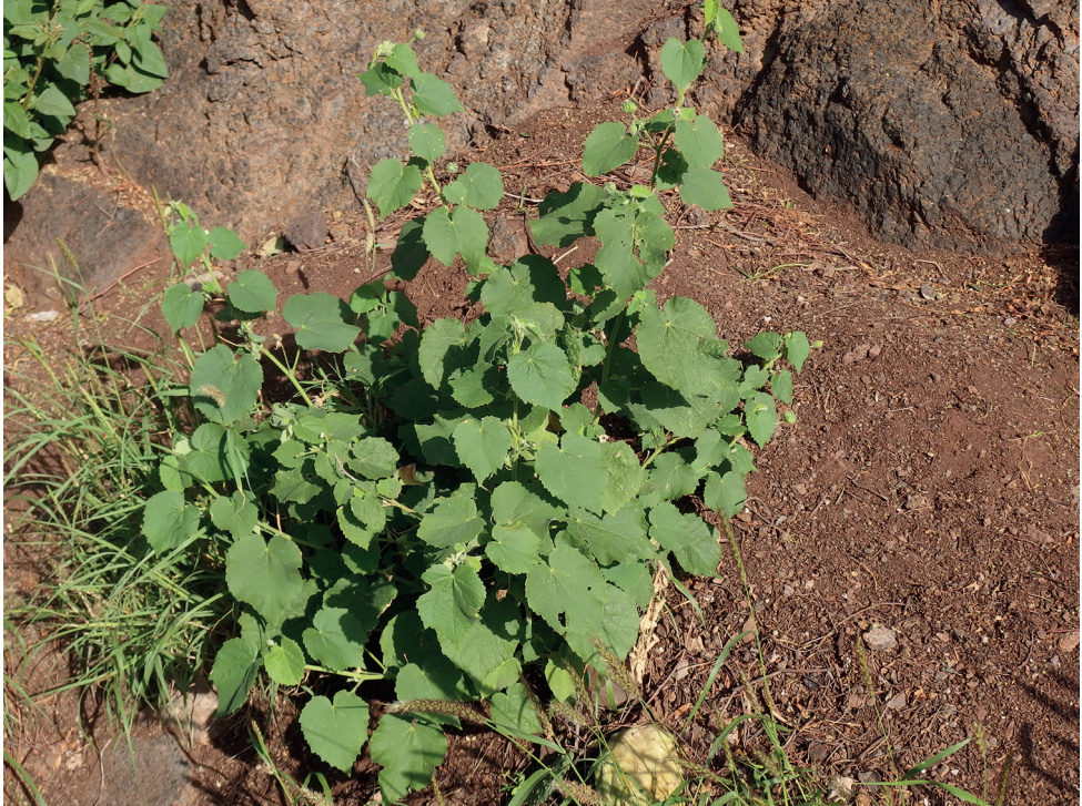
Figure 1. Abutilon albidum in Igueste de San Andrés, Tenerife. General habit of plants growing below rocks along the side of the road. December 2019, F. Verloove.