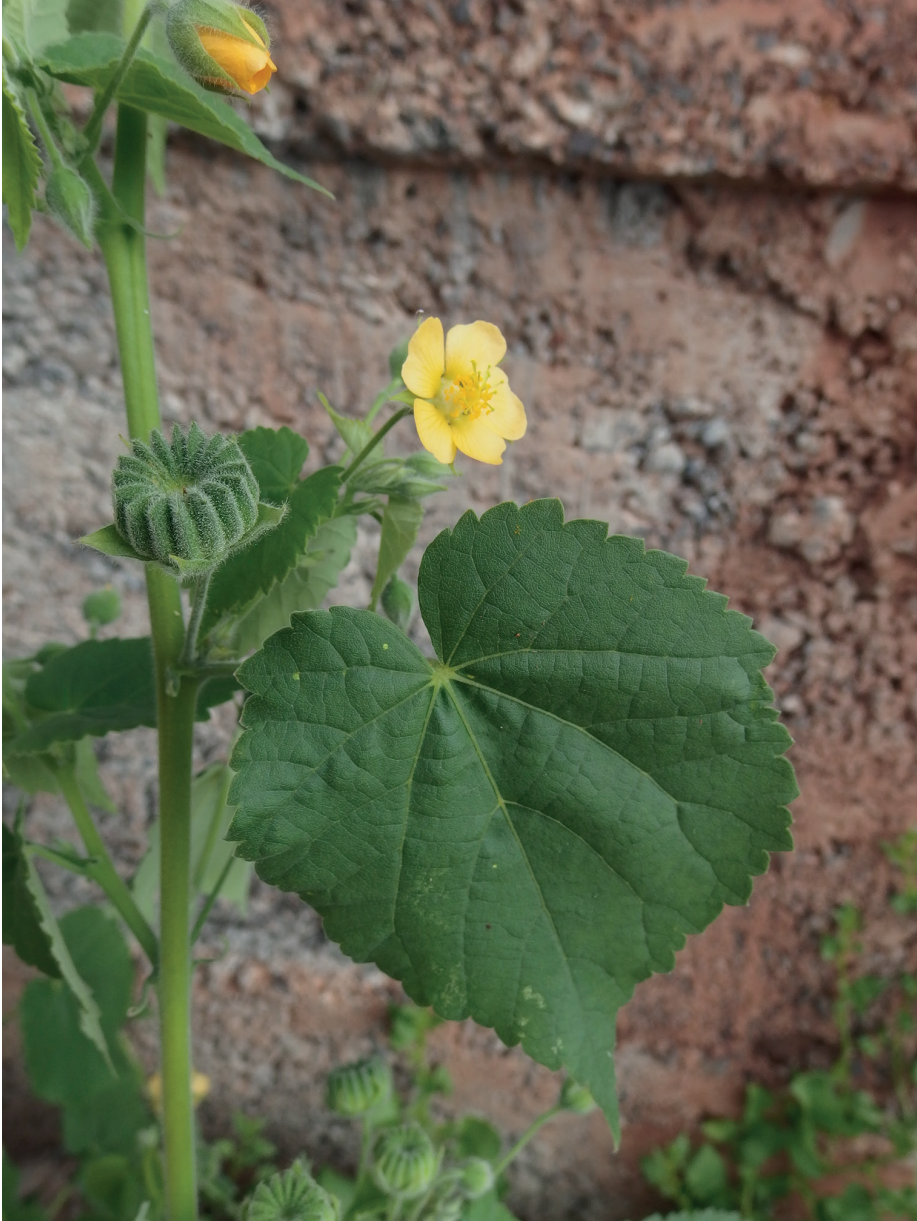
Figure 2. Abutilon albidum in Igueste de San Andrés, Tenerife. Details of flower and immature fruit. December 2019, F. Verloove.

Illustrations. Webb and Berthelot (1836) presented the first superb line drawing of Abutilon albidum . Figs 1–4 show the species in nature in the Canary Islands (Tenerife) and Morocco (Tiglit), respectively.