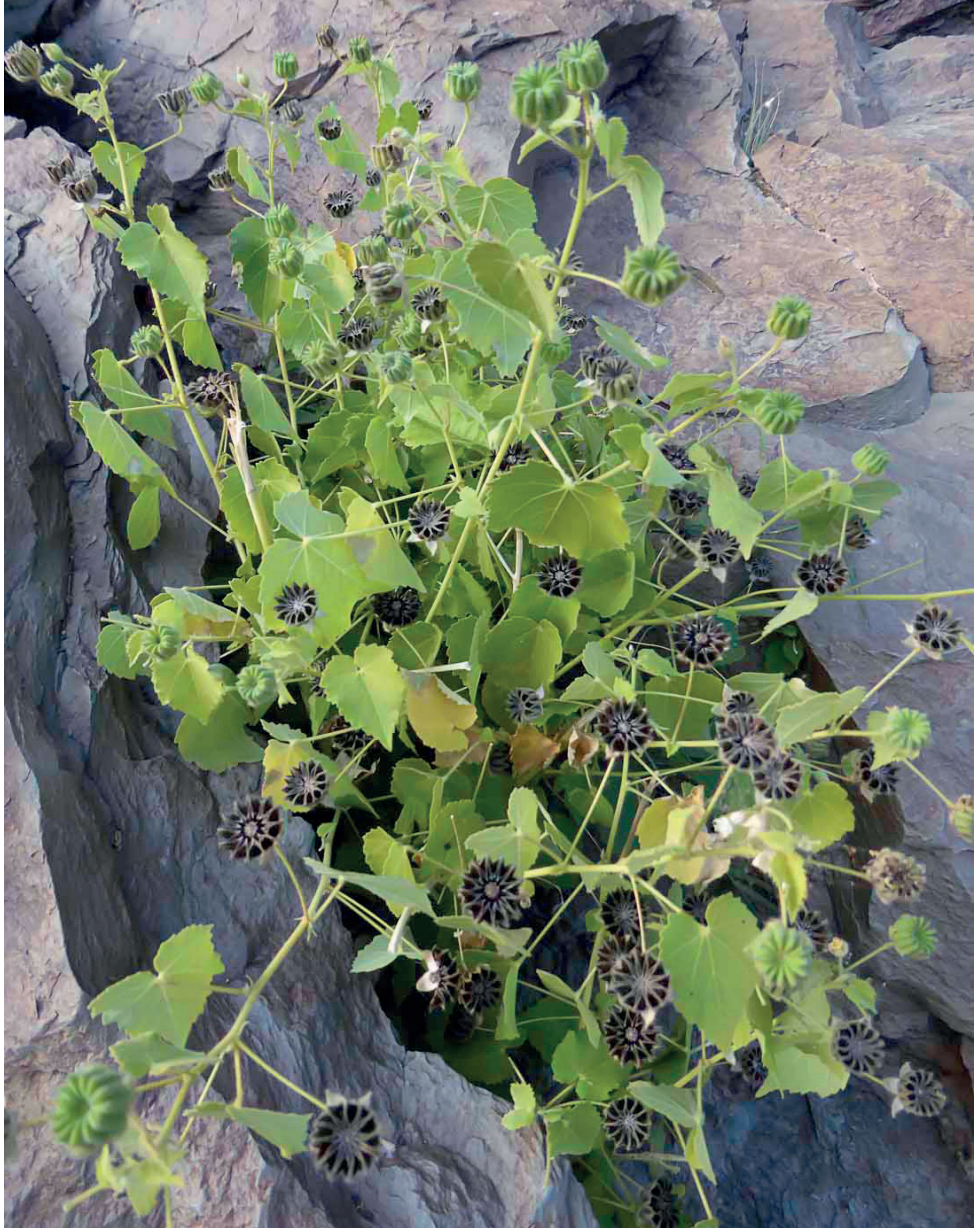
Figure 4. Abutilon albidum near Tiglit, Morocco, December 2016, A. Garcin. In Morocco, this species is usually found in more natural habitats, often in crevices of basaltic rocks in (semi-) desert areas.

all collections that have been made since then originated from the Barranco de Santos Ravine (present-day name) in Santa Cruz (Fig. 7). Historical literature sources mostly also referred to that locality (e.g. Masferrer y Arquimbau (1880); Bornmüller (1904)). Some further historical literature sources reported it from additional localities in Tenerife. According to Lindinger (1926), it was also observed in La Orotava, ca. 35 km further